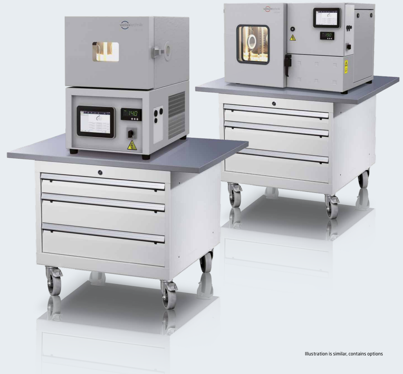
Illustration is similar, contains options

You can find further details on equipment in our technical descriptions. Contact us.