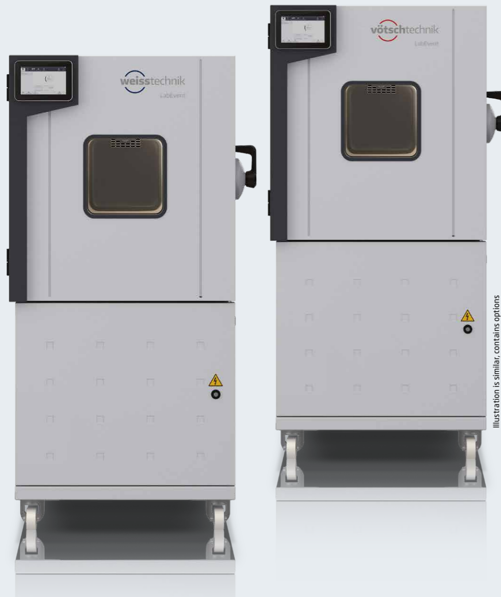
Illustration is similar, contains options

You can find further details on equipment in our technical descriptions. Contact us.