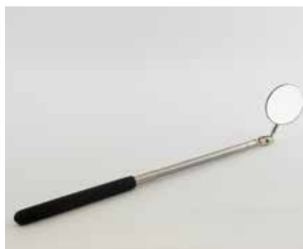
Telescope mirror (88400-0500)