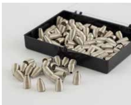
Nickel baskets (90250)