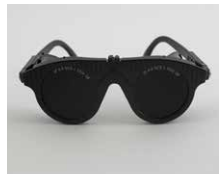
Safety glasses (88400-0499)