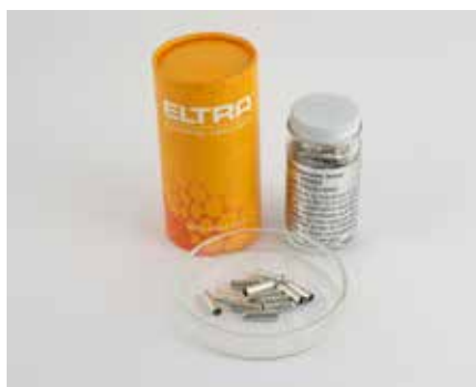
Tin capsules (90252)